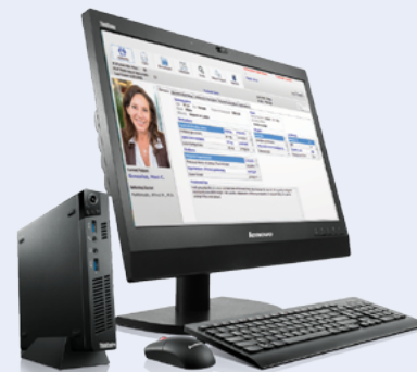
Lenovo ThinkCentre M73 Tiny